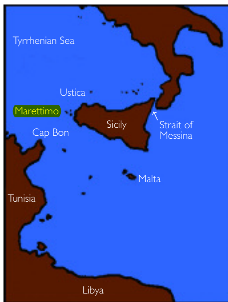
Fig. 1. Map showing the position of Ustica, and other key raptor migration watchpoints in the central Mediterranean.

Each spring, thousands of raptors cross the Mediterranean Sea between Africa and southern Italy during their northward migration to European breeding areas. Within this region, the largest concentrations have been reported at the Strait of Messina, between southern mainland Italy and Sicily (fig. 1). Corso (2001) documented an average of 26,062 raptors migrating across the Strait of Messina each spring between 1996 and 2000 (table 1). At this site, raptors crossing the Strait of Sicily, between the Cap Bon peninsula and western Sicily, converge with those migrating north